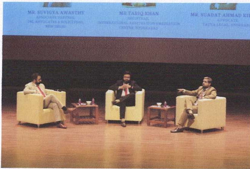
[During the Panel discussion on the topic: Appointment of Arbitrators in India: Issues, Challenges and Way forward]