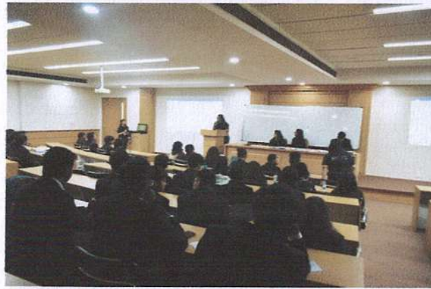
[During the draw of lots on March 18, 2023]