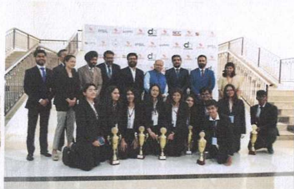
[During the valedictory ceremony]