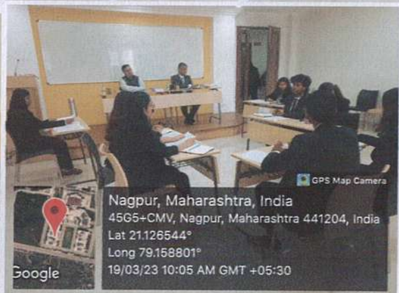
[During Preliminary rounds 1 & 2 and Semi-finals; inside the conference rooms]