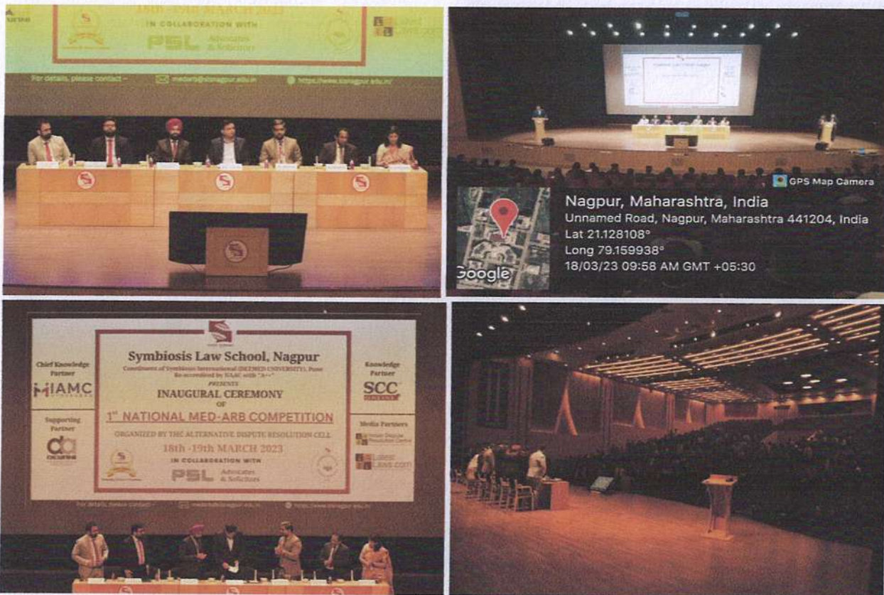
[During the Inauguration ceremony held in the Auditorium]